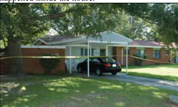
Special Agents from the Air Force Office of Special Investigation secured the crime scene.

entry point was established. Over the coming days, the alert photographer snapped hundreds of photographs of the interior and exterior of the Schliepsiek residence, while investigators collected blood samples from the floors, doors, and walls. Other physical evidence, such as Andy Schliepsiek's cellular phone and Jamie Schliepsiek's bloodied jean skirt, were removed from the house for preservation in AFOSI's evidence locker. After this initial phase of evidence collection was complete, AFOSI locked the house and departed, and the yellow band of crime scene tape ringing the property became the only outwardly visible sign that something had happened inside the house.