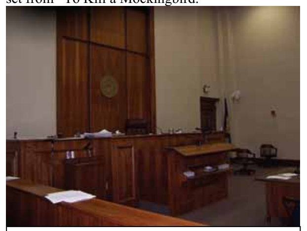
The judge's bench at the Bibb County Courthouse, Georgia.

The large courtroom provided seating and at least a small measure of separation for the two sets of family and friends, with ample room for interested observers and representatives of the media. In fact, there was seating for more than 200 in the courtroom. The courtroom, with its high ceilings and large balcony, had many attendees remarking on its similarity to the movie set from "To Kill a Mockingbird."