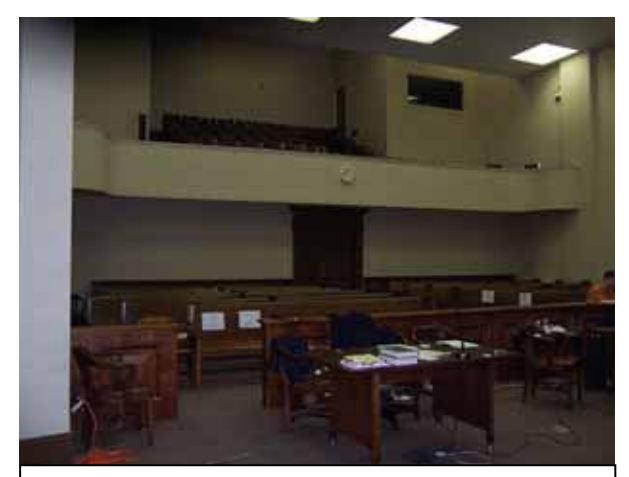
View of counsel's table and spectator area, Bibb County Courthouse.

The security of the building was also reassuring. Before reaching the courtroom, every spectator first passed through metal detectors and ran their belongings through an X-ray machine at the main entrance to the building. In the hallways, bailiffs and security guards always ensured the conduct of all visitors to the courthouse was appropriate.